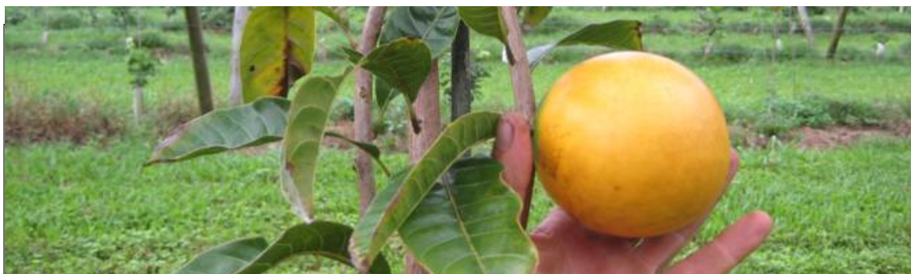
Abiu harvested just two years after planting