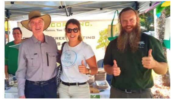
Groups who work with threatened species, native wildlife or other environment conservation activities will be displaying the work they do.