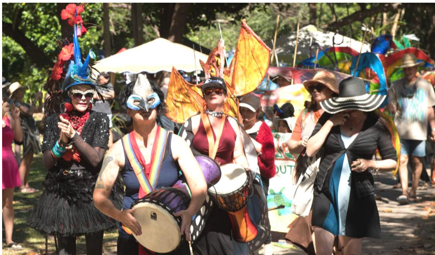
The spectacular Drumming of Cassowaries Grand Parade