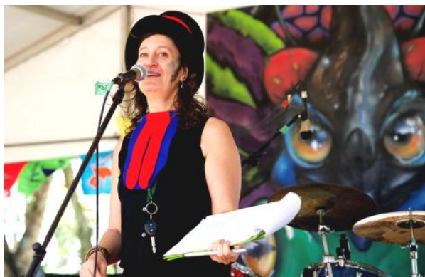
Visitors and locals are inspired to dress up for the day