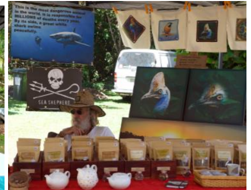
There will be a variety products sold at the market stalls set up under the trees in the park.