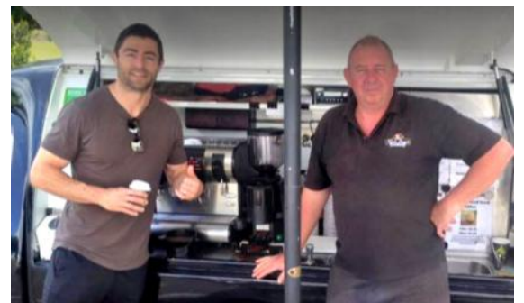
The food court will feature a selection of food for all tastes along with cakes, biscuits coffee, tea and soft drinks.