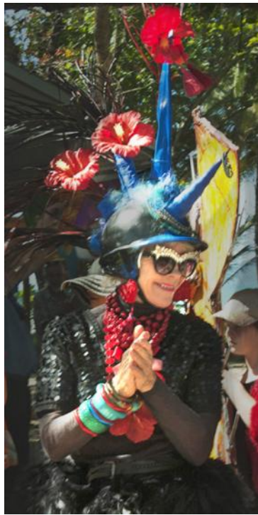
'Queenie' in 2019