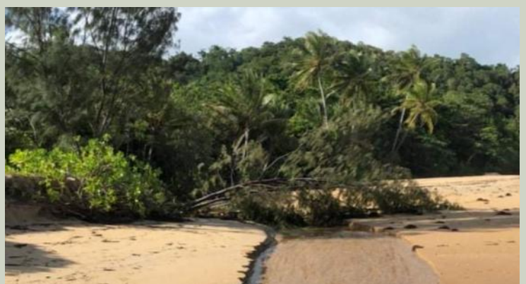
22 Jan 2022 Collapse of the she-oak tree.