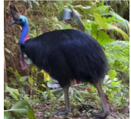
Shearwaters / Bunurong/Boonwurrung Country -Cassowaries/ Djiru Country