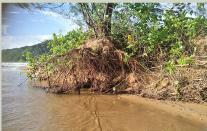
Jan 2022 Severe erosion of dune vegetation