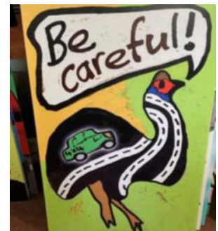
Shearwater/cassowary children's conservation messages