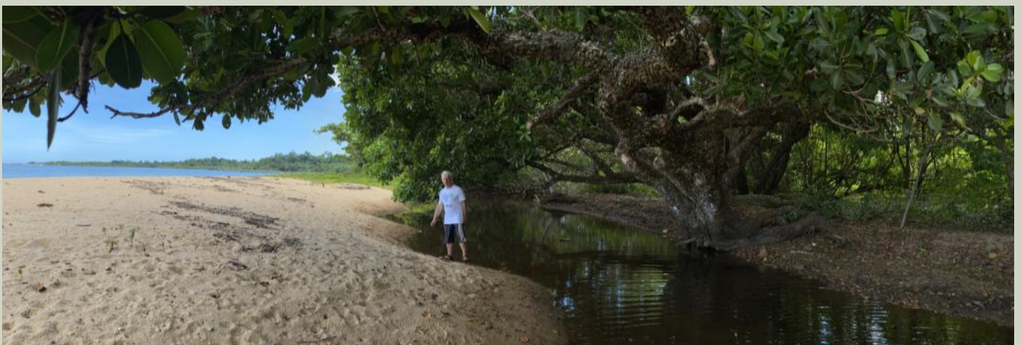
Visiting riparian expert Ed Thexton dwarfed by the magnificent Calophyllum tree at Narragon Beach ICOLL